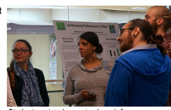
Students get a chance to share information after the poster presentation at WSU